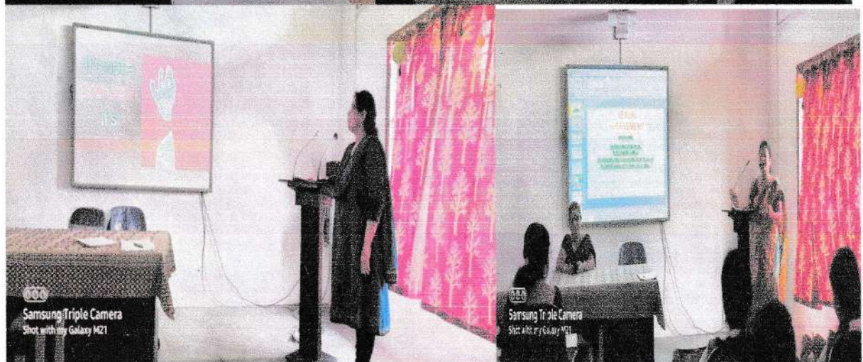
The ICC members conducting an awareness programme on the Sexual Harassment Act in the college on March20,2021, where 43 students participated in the programme.