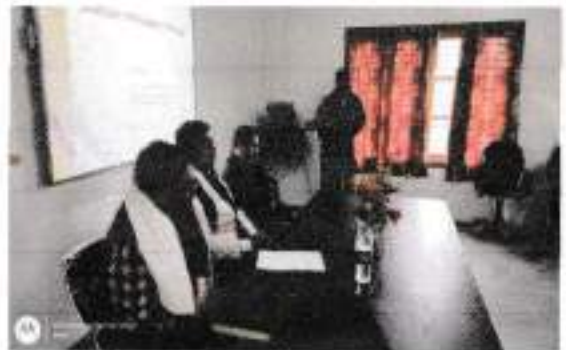
A view of One day Workshop on "Structure of Academic Writing."