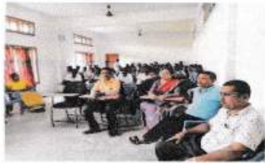
A view of College Level Seminar on "Environmental Protection and Present Social System"