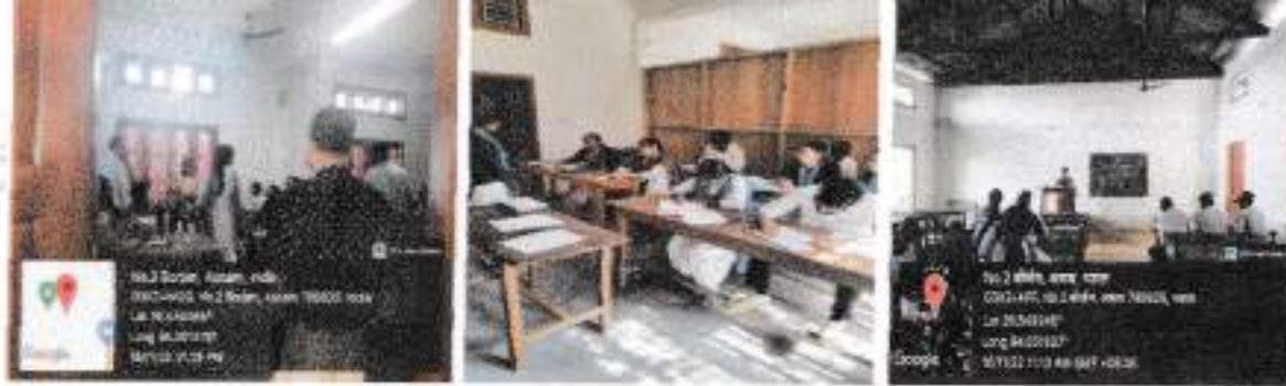
7. Spoken English by Department of English