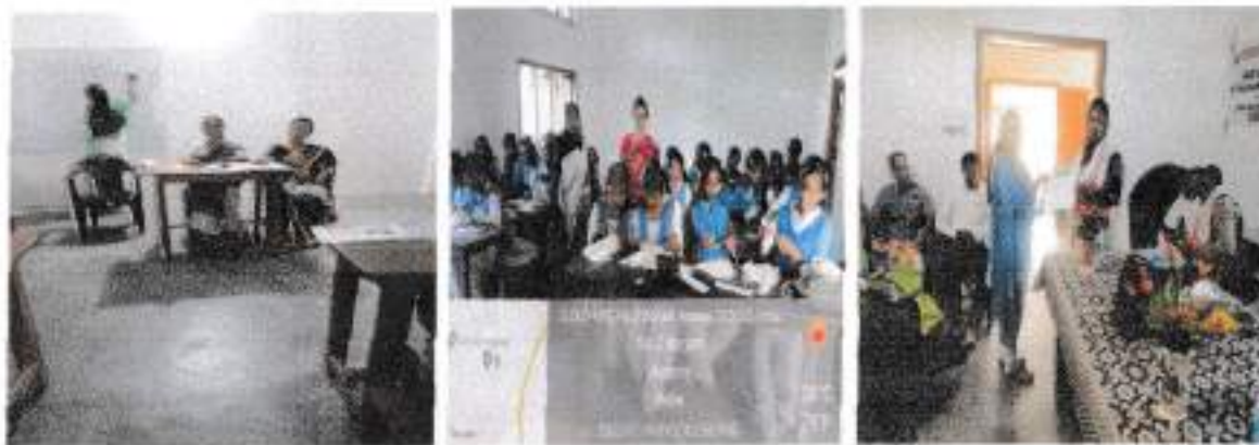
3. Cutting & Embroidery by Department of Philosophy