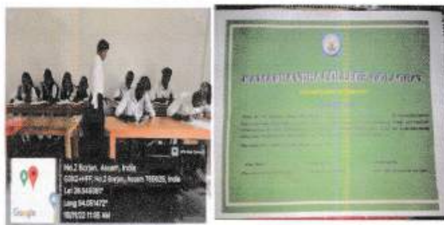
6. Travel & Tourism by Department of History

AS Coordinator, IQAC Kamarbandha College