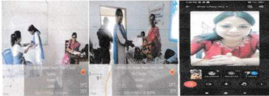
1. Beautician course by Department of Education

Some images of Add on courses by Departments of Kamarbandha College