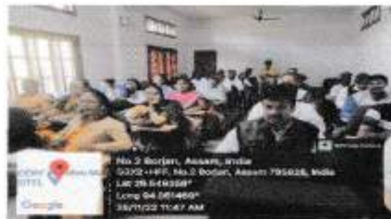
A view of Inauguration Ceremony of "Incubation Centre of Entrepreneurship Development"