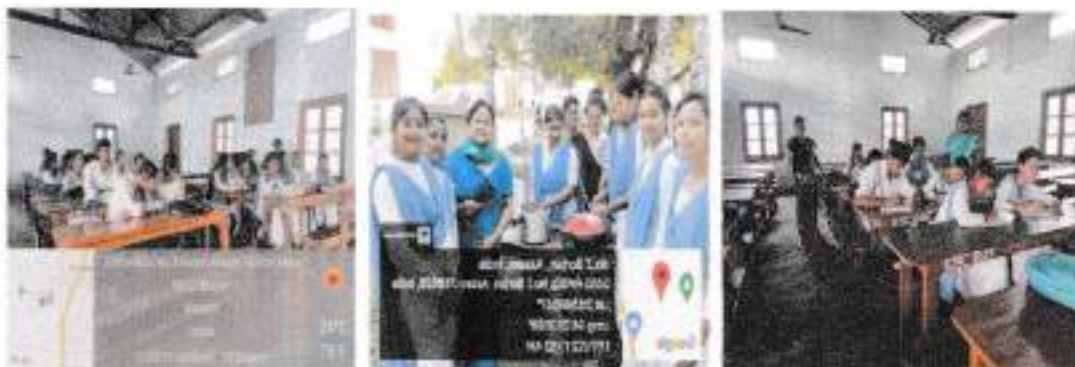
4. Food Processing and Preservation by Department of Assamese