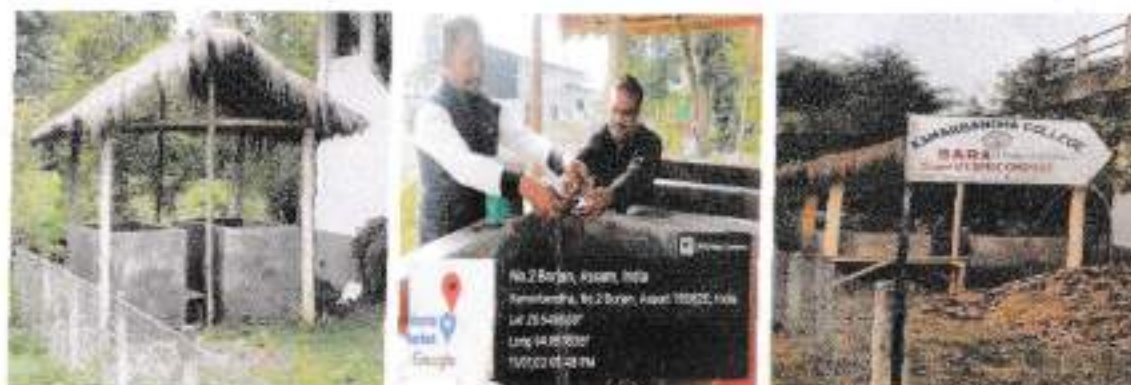
5. Vermicomposting by Department of Political