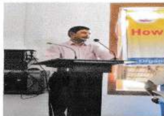
A view of One Day Workshop on "How to Prepare and Present a Seminar Paper."