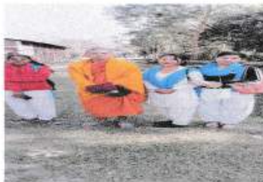
Buddhist Temple of Borhola