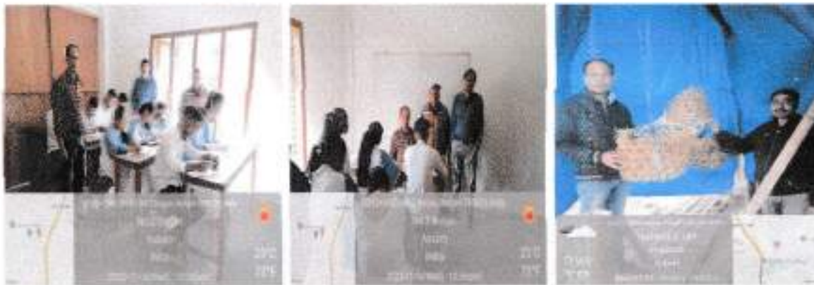
2. Mashroom Cultivation by Department of Sociology