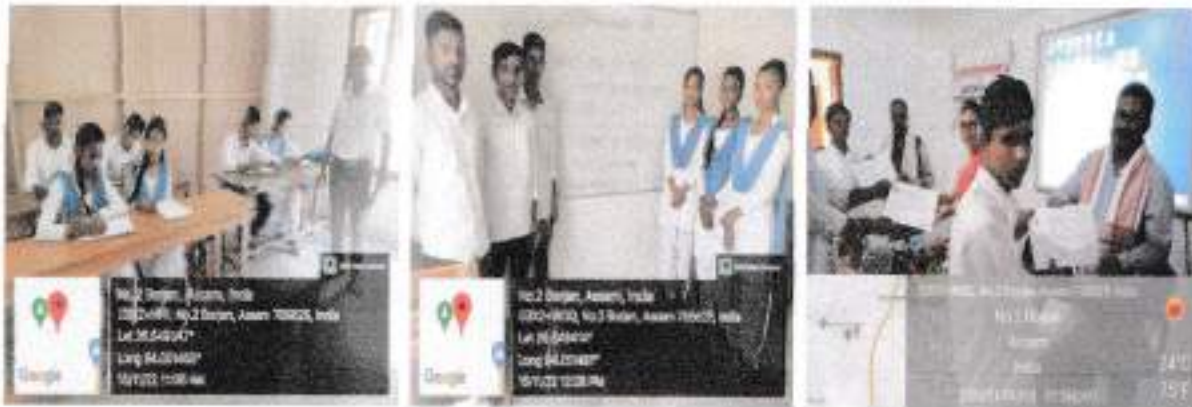
8. Entrepreneurship Development by Department of Economics